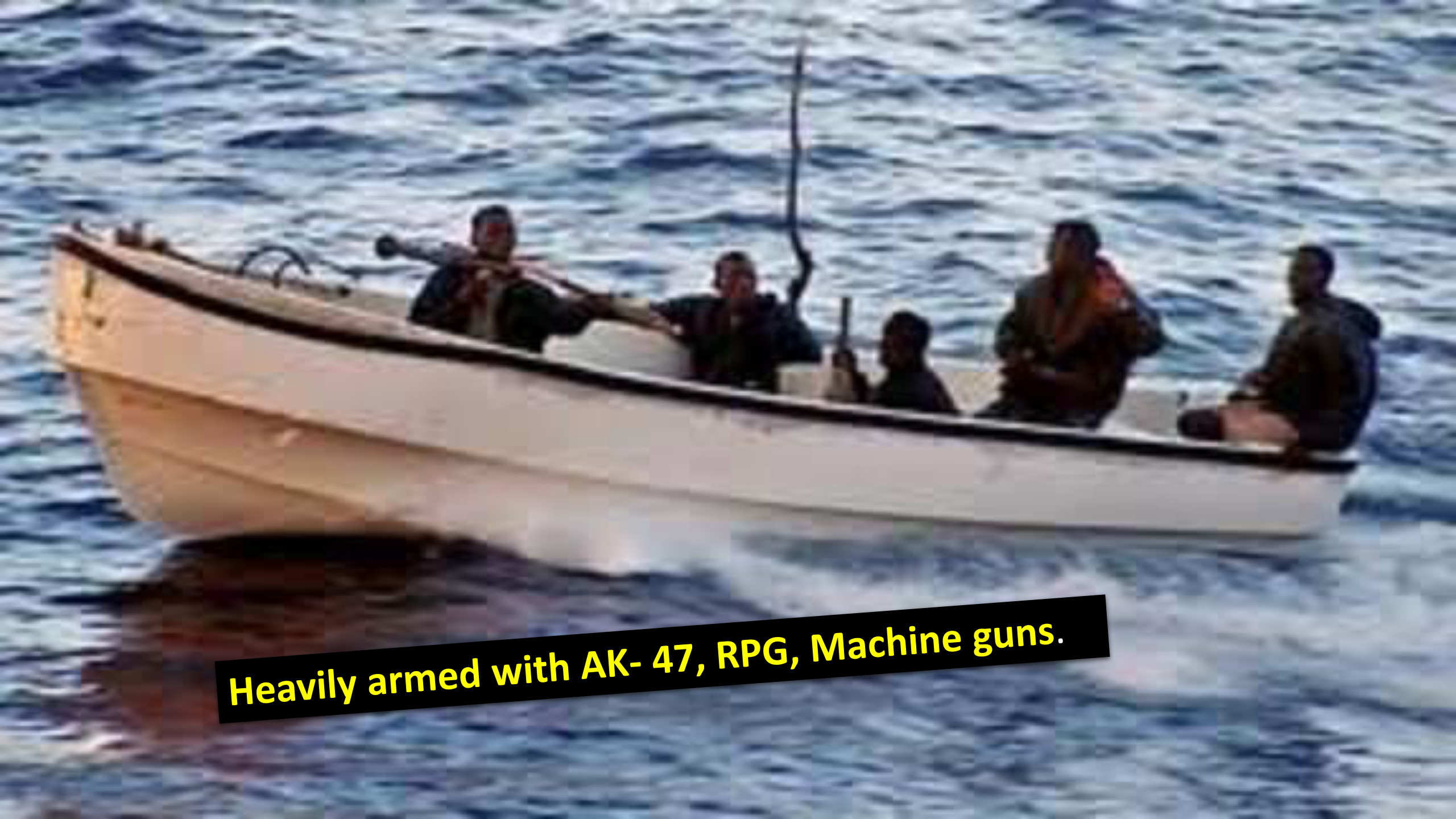
Heavily armed with AK- 47, RPG, Machine guns.