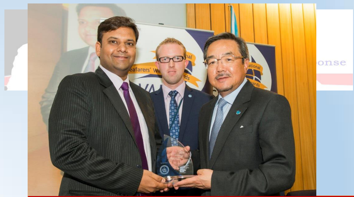
Bestowed with Dr Dierk Lindemann Welfare Personality of the year award by Hon'ble Secretary General of IMO

Achievements and Recognition of the work done by MPHRP