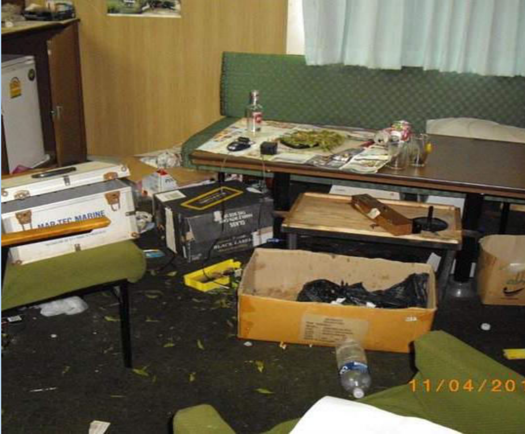
The Master's Office